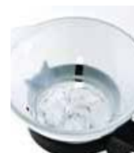
Put in the ice strainer