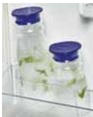
Compact size that fits inside the refrigerator rack.