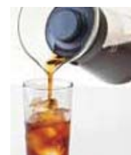
iced coffee can be made instantly