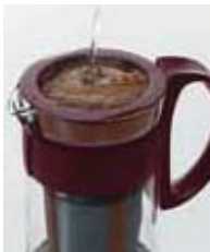
Pour water to the line.

You can make iced coffee with just coffee and water. Pour small amounts of water to wet the entire coffee grounds and drip with a circular movement. When the water is poured, refrigerate it for 8 hours and let the coffee seep.