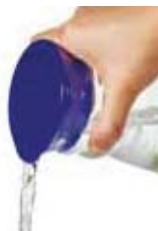
Easy to hold, easy to pour.

The form factor makes it easy to hold, and can be stored in the refrigerator. With its wide opening, it's easy to wash and keep clean for long periods of use. Due to the pot's heatproof glass, color and smell of food is less likely to transfer to the glass. It's also dishwasher safe.