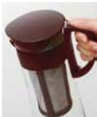
Easy to hold handle.