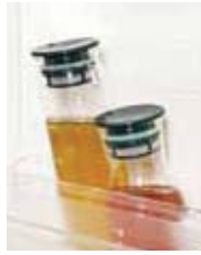
Refrigerate for 3-6 hours until completion.