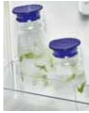
Compact size that fits inside the refrigerator rack.