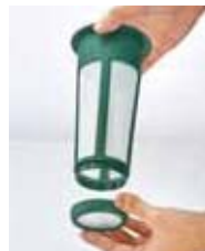
The tea strainer's bottom portion is removable for easy washing.