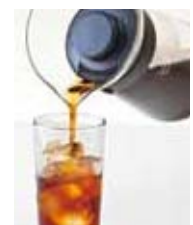
iced coffee can be made instantly