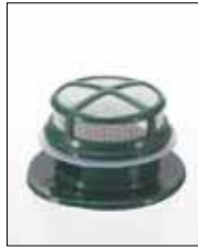
Lid comes with a mesh filter.