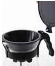
The lid comes off.