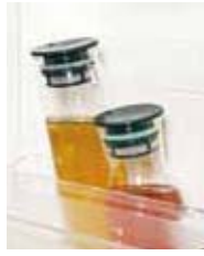
Refrigerate for 3-6 hours until completion.