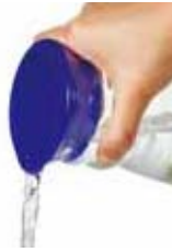
Easy to hold, easy to pour.