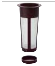
The tea strainer's bottom portion can be taken off for easy cleaning.