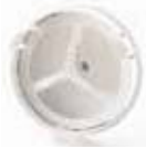
Lid with tea strainer.

You can enjoy the variety of color in the tea. As the lid has the tea strainer attached directly to it, you can pour it straight away. This teapot includes a hook for teabags.