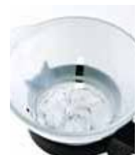
Put in the ice strainer