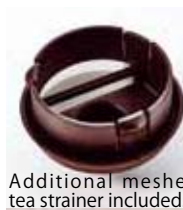
Additional meshed tea strainer included.

C/T24 044463 W169 · D135 · H157 top opening diameter 87 practical capacity (below band) 1,000ml microwave safe including lid