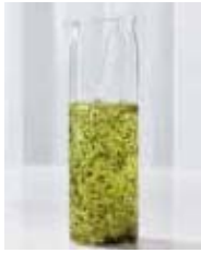
Add tea leaves and water.

Place roughly 15 g of tea inside the pot and add water to the 1000 line. (MD-10) Place the lid to cover and refrigerate for 3-6 hours until completion. As the lid includes a mesh filter, you can serve directly from the pot.