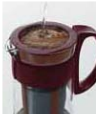
Pour water to the line.

You can make iced coffee with just coffee and water. Pour small amounts of water to wet the entire coffee grounds and drip with a circular movement. When the water is poured, refrigerate it for 8 hours and let the coffee seep.